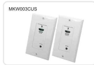
30M wallplate extender with IR