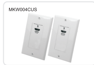
30M wallplate extender