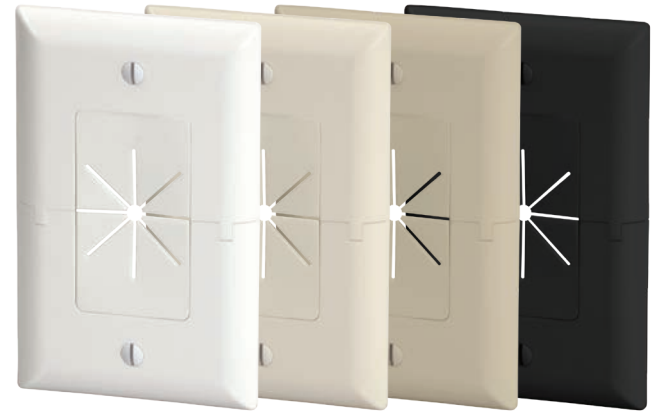
White Lite Almond Ivory Black

DataComm Electronics' patented Split Plate with Flexible Opening to install low voltage cables behind your HDTV, amplifier or other audio video devices. With the split design, this Cable Plate can be installed around existing low voltage cables run through the wall, eliminating the need to re-pull wires keeping the opening in the wall covered.