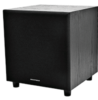
P/N8248 8" 60-Watt Powered Subwoofer - Black