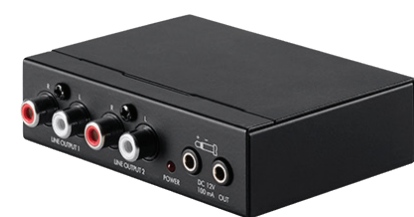
P/N13356 Multizone RJ45 to RCA Converter