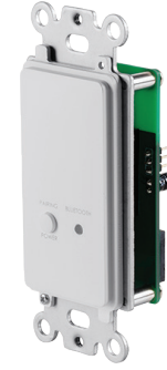
P/N13358 Multizone Source Keypad w. Bluetooth® Receiver