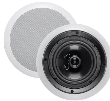
P/N18587 Aria Ceiling Speakers 6.5" Polypropylene 2-Way (pair)