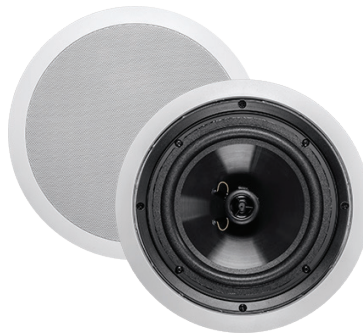
P/N18588 Aria Ceiling Speakers 8" Polypropylene 2-Way (pair)