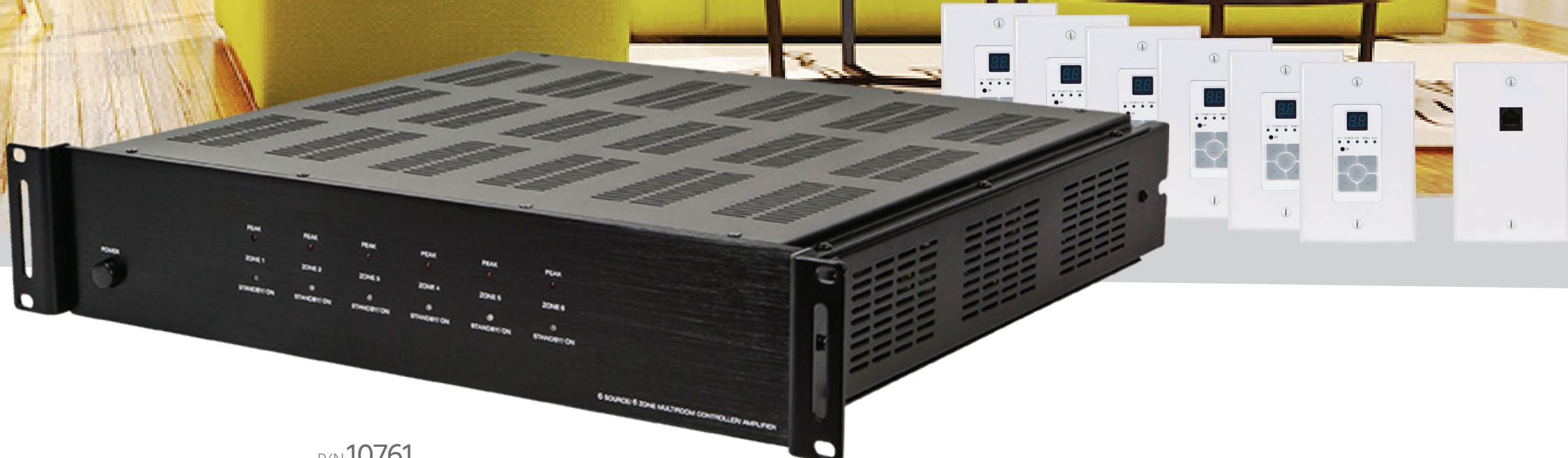
P/N10761 6 Zone Home Audio Multizone Controller and Amplifier Kit