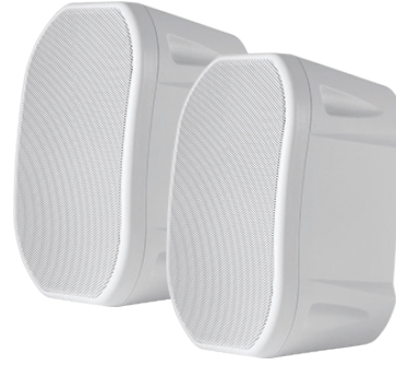
P/N13612 4" Weatherproof 2-Way Speakers w. Wall Mount Bracket (Pair)