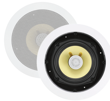
P/N4102 Caliber Ceiling Speakers 5.25" Fiber 2-Way (pair)