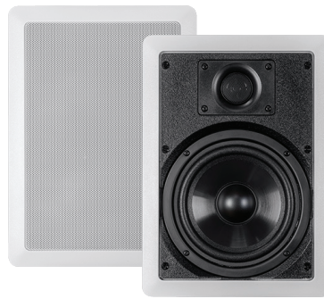
P/N18590 Aria In-Wall Speakers 6.5" Polypropylene 2-Way (pair)