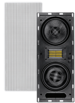
P/N15700 Amber In-Wall Speaker 6.5" 3-way Carbon Fiber Column w. Ribbon Tweeter (each)