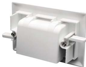
Installation Diagram - Front View

The new Slim Fit version is designed for use in concrete wall applications where the wall cavity is 3/4" to 1" in depth.